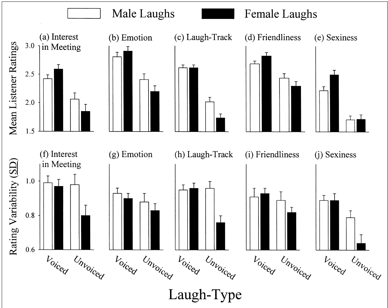
Fig. 2. Mean listener ratings in Experiments 1 through 5 (a–e), and variability associated with those ratings (f–j). Error bars show standard errors. For each rating strategy, responses were coded using a scale from 1 ( most negative ) to 4 ( most positive ).

male listeners were comparatively uninterested in meeting females who produced unvoiced laughs, and were consistent about this.